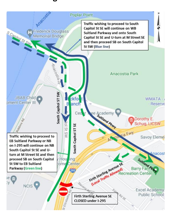
Firth Sterling Avenue SE Closure & Detour

Firth Sterling Avenue SE between South Capitol Street SE and St Elizabeths Street SE will be closed from Friday, October 22 at 9:00 a.m. through the weekend to Monday, October 25, 2021, at 5:00 a.m. for bridge construction. When Firth Sterling Avenue SE is fully closed, Suitland Parkway SE and South Capitol Street SE will remain open to all traffic. A marked detour will be in place during these closures.