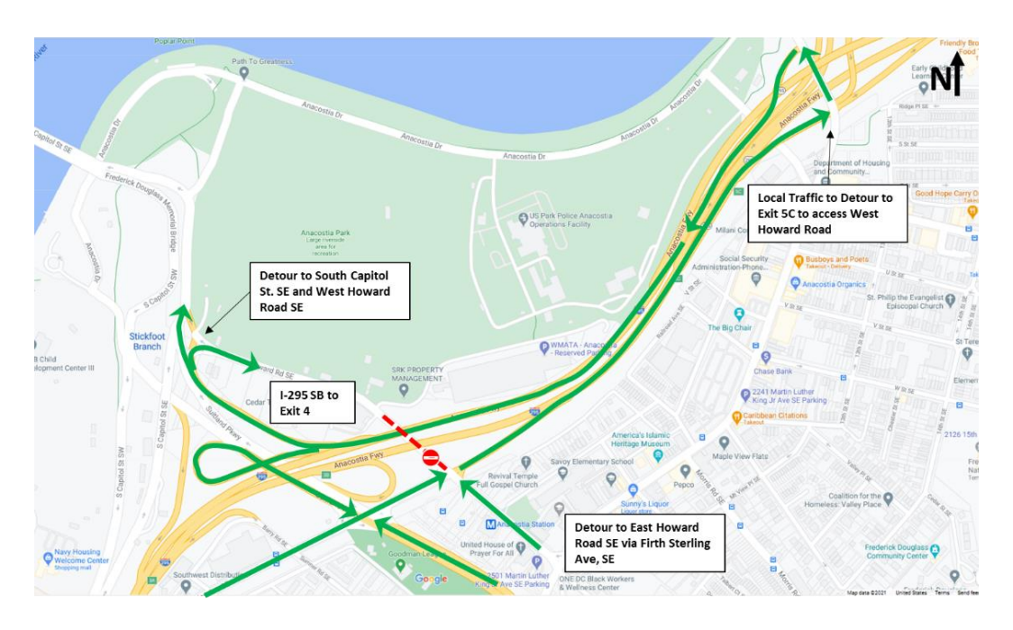
Firth Sterling Avenue SE Closure & Detour